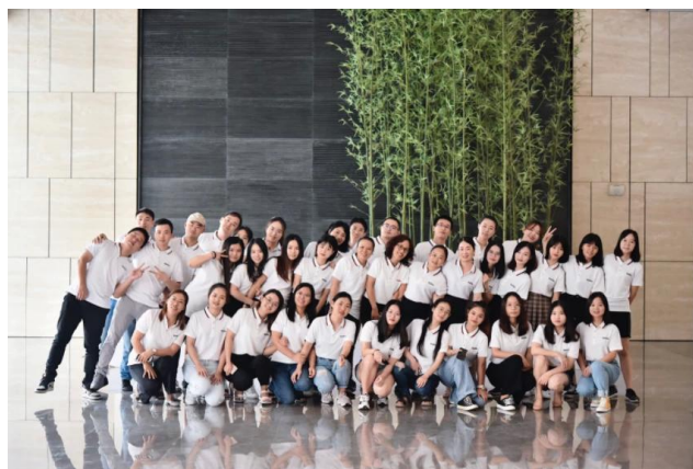
Sunny Worldwide Logistics Team