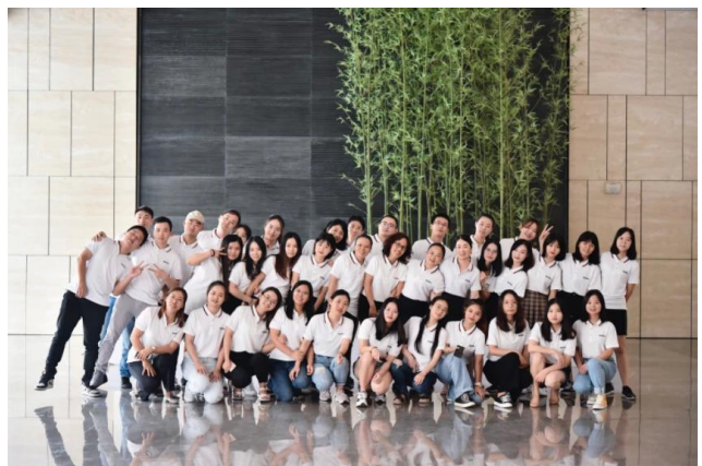
Sunny Worldwide Logistics Team

Here is the guidance to get your freight quote done