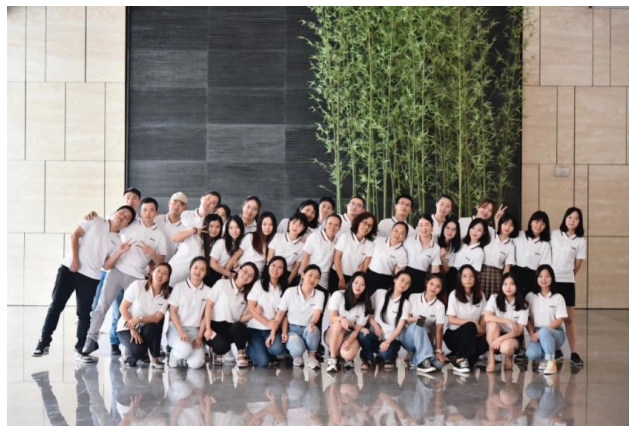
Sunny Worldwide Logistics Team