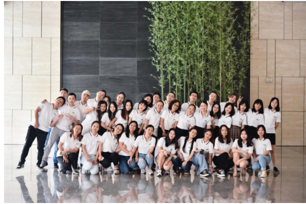
Sunny Global Logistics Team