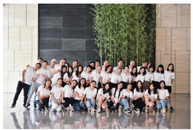
Sunny Worldwide Logistics Team