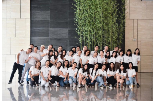
Sunny Worldwide Logistics Team