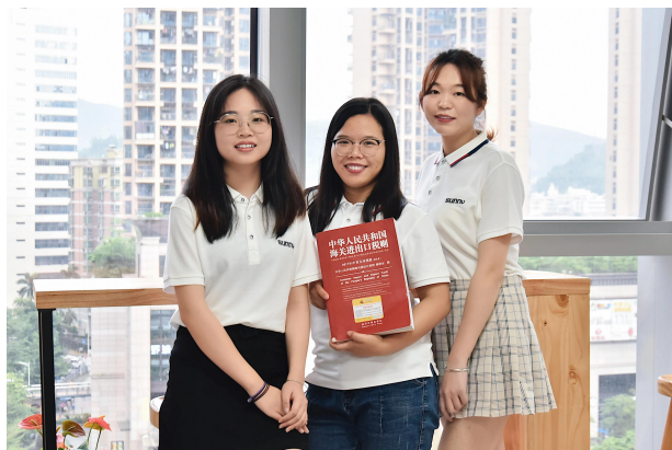
Customer Service Department

Book vessel schedule as you wish, timely submit shipping instructions, strictly follow up the custom clearance procedures. Ensure the shipment smoothly delivered to your hand.