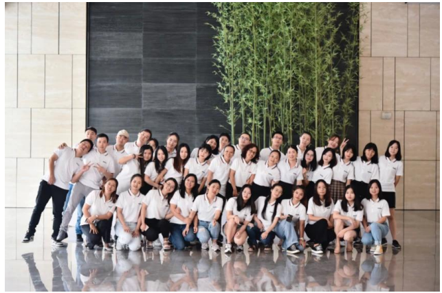
Sunny Worldwide Logistics Team