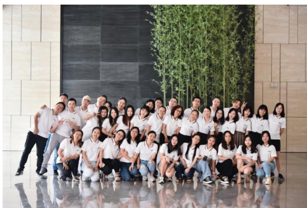
Sunny Worldwide Logistics Team