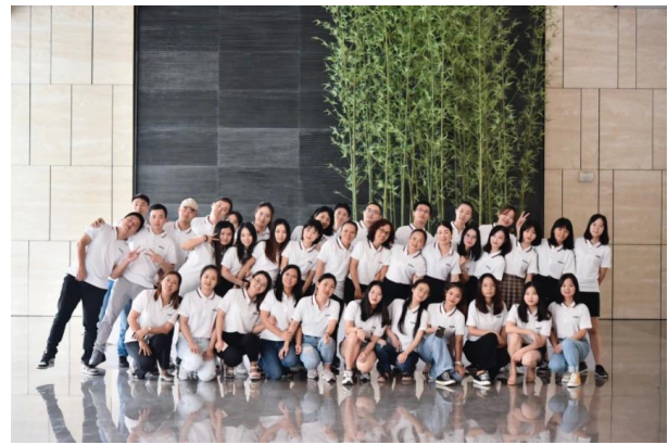
Sunny Worldwide Logistics Team