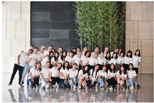
Sunny Worldwide Logistics Team