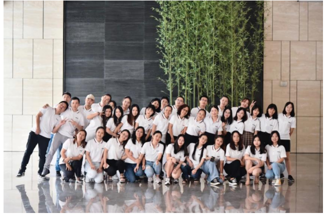
Sunny Worldwide Logistics Team