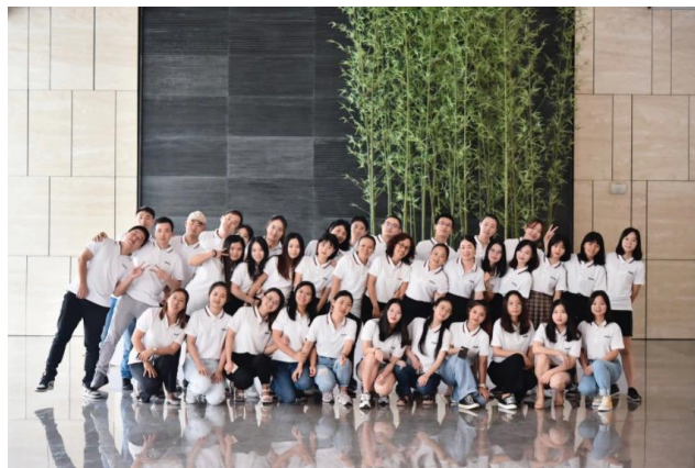
Sunny Worldwide Logistics Team