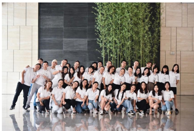
Sunny Worldwide Logistics Team