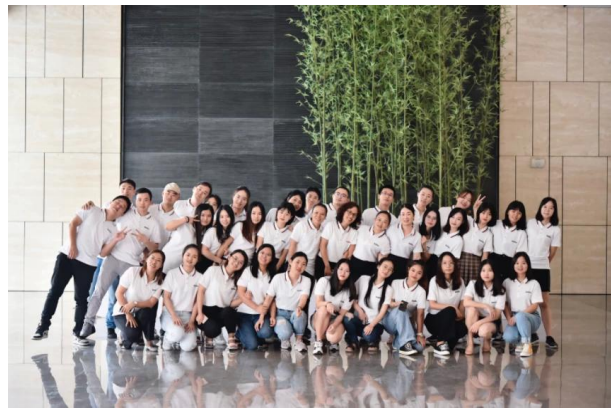
Sunny Global Logistics Team