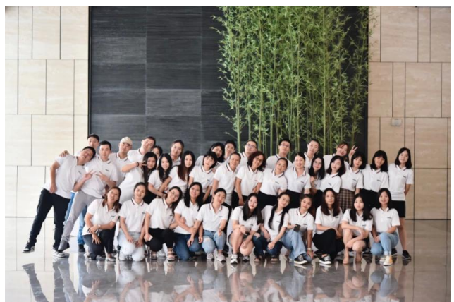
Sunny Worldwide Logistics Team