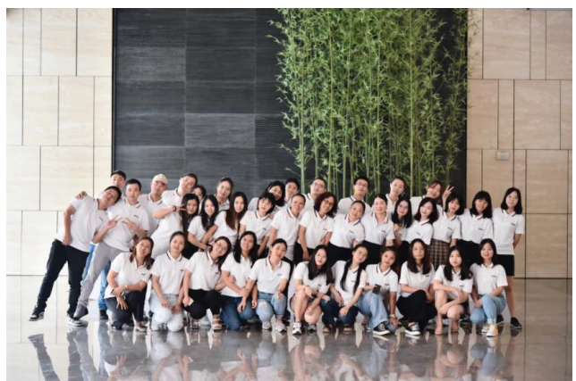
Sunny Worldwide Logistics Team