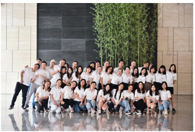
Sunny Worldwide Logistics Team