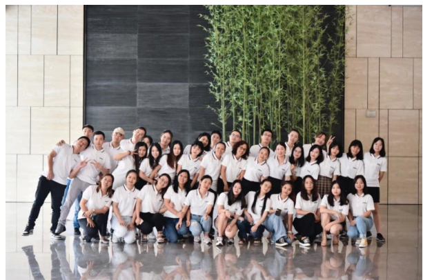
Sunny Worldwide Logistics Team