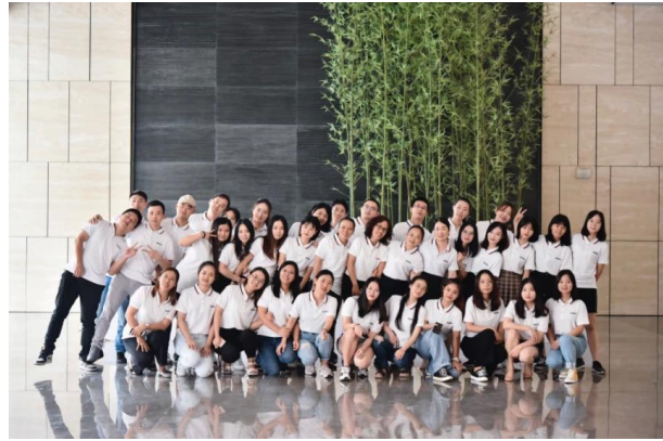
Sunny Worldwide Logistics Team