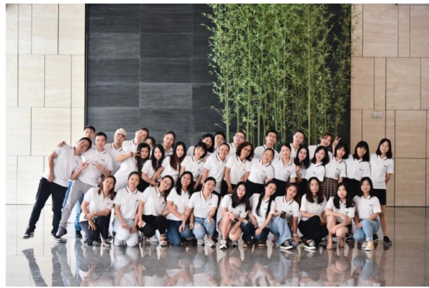
Sunny Worldwide Logistics Team